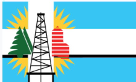
Former flag of Ft. St. John.

Over the years the community has been moved a number of times for varying economic reasons. The present location is thought to be its sixth. The original trading post built in the area was named Rocky Mountain House (not to be confused with the modern Alberta town by that name ). It was established one year after Sir Alexander Mackenzie explored the area in 1793. One of a series of forts along the Peace River constructed to service the fur trade, it was located southwest of the present site of Fort St. John. The Dunneza and Sikanni First Nations used it as a trading post. It was also used as a supply depot for further expeditions into the territory. The fort closed in 1805. Fort d'EpINETTE was built in 1806 by the North West Company . It was renamed Fort St. John in 1821 following the purchase of the North West Company by the Hudson's Bay Company . This fort was located about 500 metres downstream from the mouth of the Beaton River , which at that time was known as the Pine River (d'epinette in French ). It was shut down in 1823. The site was designated a National Historic Site of Canada in 1958. [3][4]